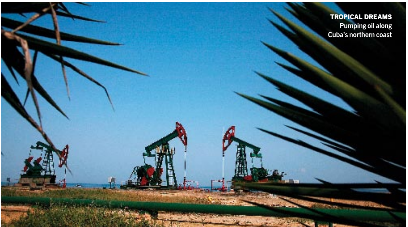
TROPICAL DREAMS Pumping oil along Cuba's northern coast